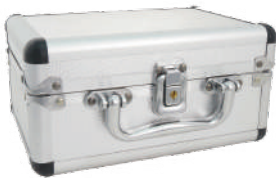
▼ Accessories Shake-proof box size: 200mm*140mm*100mm