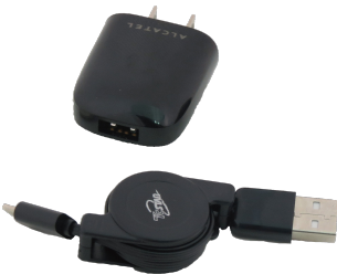
▼ Accessories Accessory kits: charger, charging cable